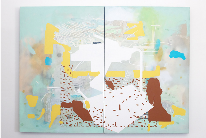
Corner Meander, 2017 Oil on canvas mounted to panel 72 x 96 inches $10,000.