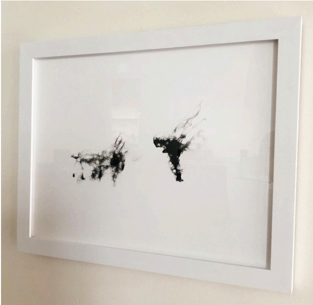
guncotton coordinates, 2018 Software generated digital archival print, 1/9, 17 x 22 inches $1,060. (framed) $900. (unframed)