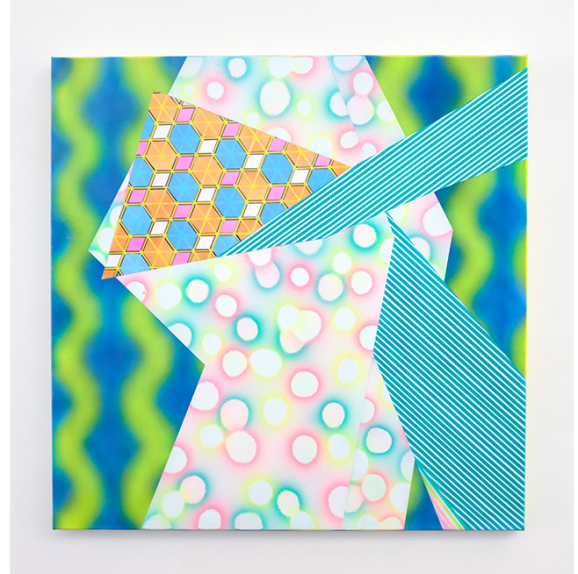
Fruit Stripe, 2019 acrylic and airbrush on canvas 36 x 36 inches $4,500.