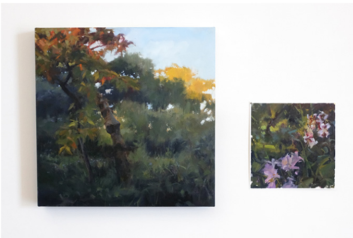
Berdelle Campbell Garden oil on canvas over panel, 24 x 24 x 2.5 in $2,700.