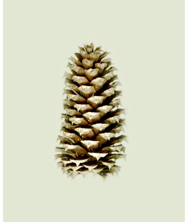
untitled (Pines Before Lightning), 2019 direct digital print on acrylic in painted artist frame 49 x 37 inches $3,000