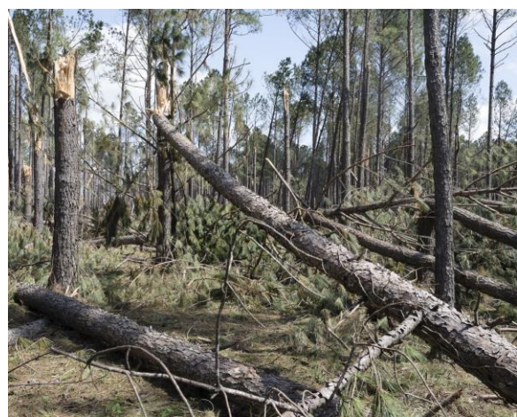
Aftermath of Hurricane Sally, Alabama (II), 2020