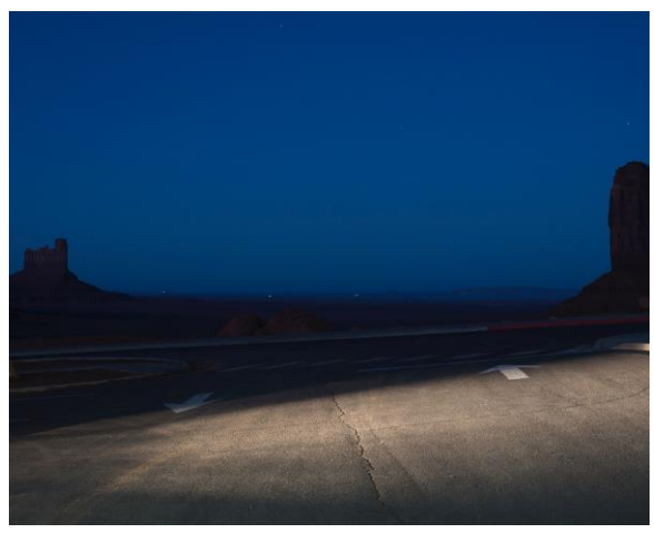
Monument Valley Navajo Tribal Park, Arizona, 2018