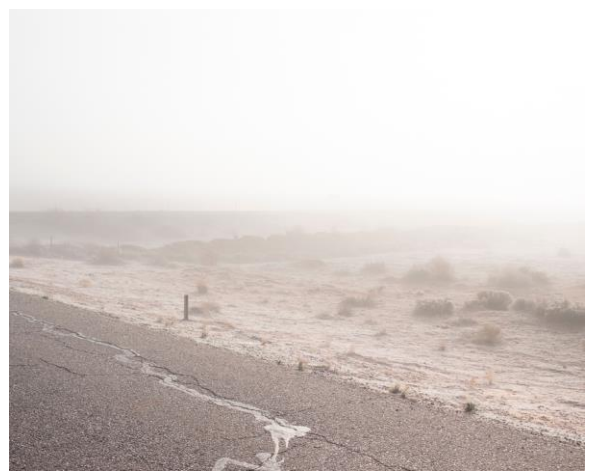
US 163, Utah, 2018