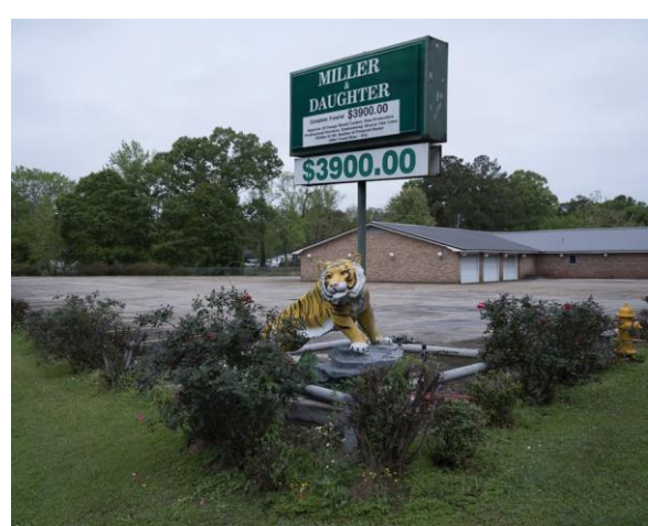
Mortuary, Zachary, LA, 2020