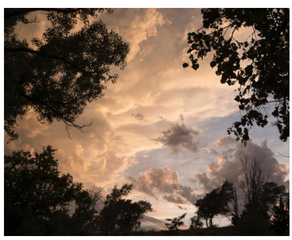
Approaching Storm, Kansas, 2020