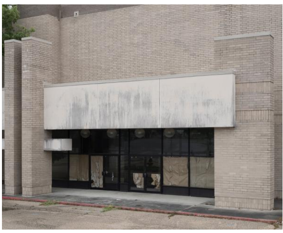
Shopping Center, Baton Rouge, LA, 2020.