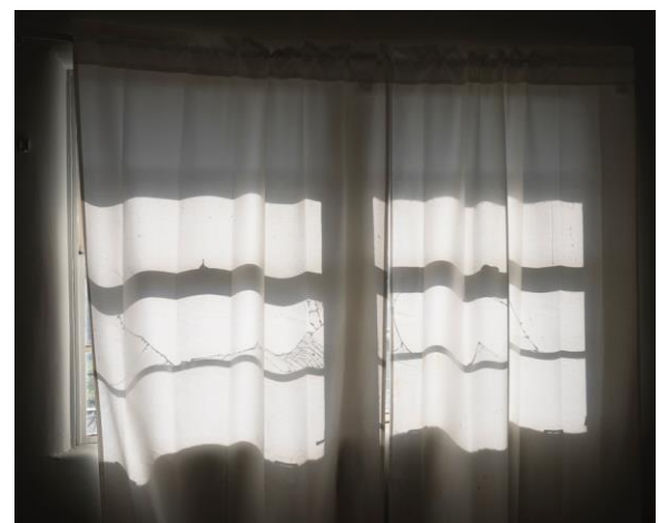
Window, Kansas, 2020