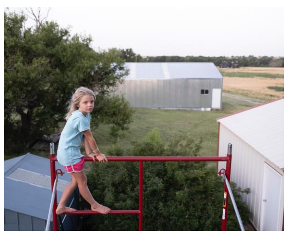
Gretta, Russell County, Kansas, 2020