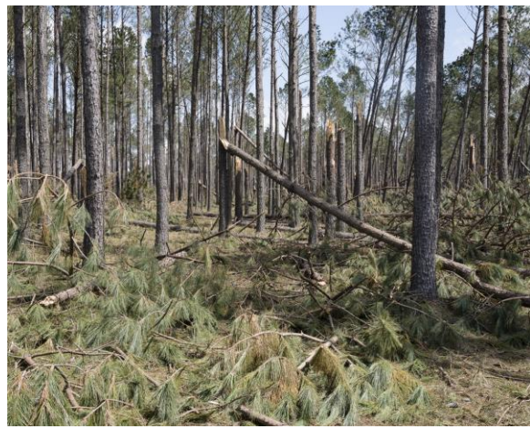
Aftermath of Hurricane Sally, Alabama (I), 2020