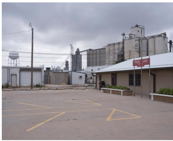
Sublette, KS, 2020.