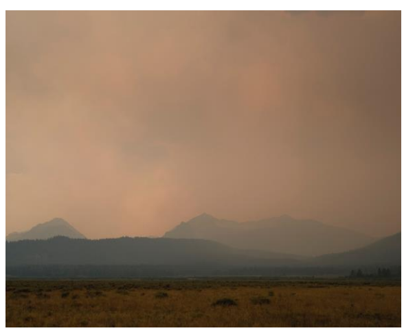
Wildfire, Idaho, 2016