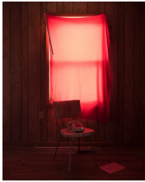
Telephone, Russell County, KS, 2020

We Hold These Truths is a selection of photographs made across the U.S. during the Trump presidency. Drawn from the Declaration of Independence, the title implicates "We" the viewer as an active participant, acknowledging the collective responsibility shared in our democracy. The photographs reveal the anxiety felt across the nation and speak to this historic moment, as tensions run increasingly high in the run-up to the 2020 presidential election.