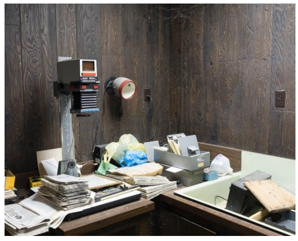
Former Darkroom, Haskell County Monitor-Chief, Sublette, KS, 2020.