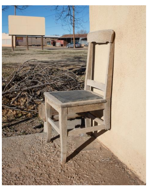
Chair, Tucumcari, NM, 2018